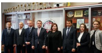
Delegation from Ukraine in

More information about the DBR: https://dbr.gov.ua